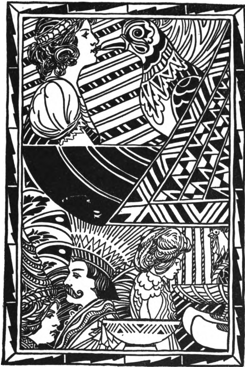
The Princess Kissed Its Coral Beak